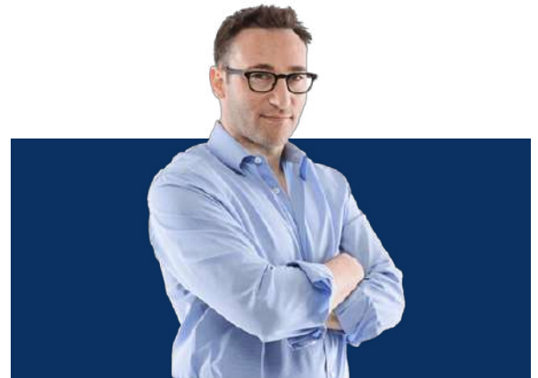
Simon Sinek British-American Motivational Speaker

"You can either step forward into growth or you can step back into safety."